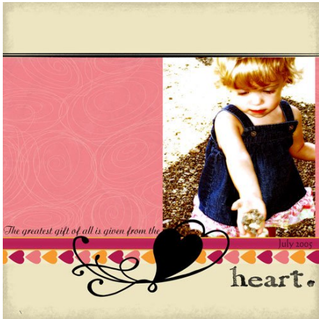
Heart by Kris

So Swirly is a whimsical set of 12 brushes and stamps perfect for that extra swirl you're looking for! $3.00 see them HERE!