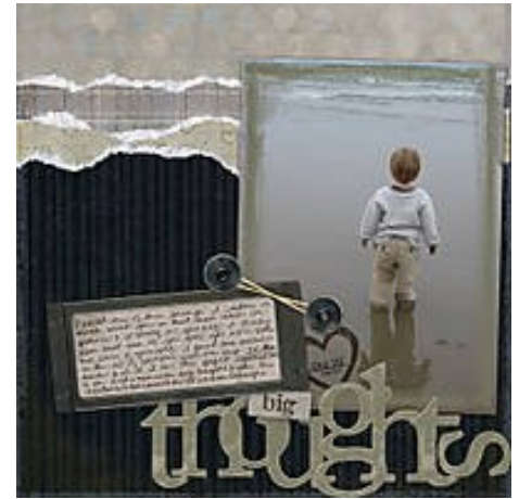
Big Thoughts by Shawna

"Grey Day" has both a paper and an element pack , or if you would like both, pick up the combo pack , and save fifty cents of the price of the separate pieces.